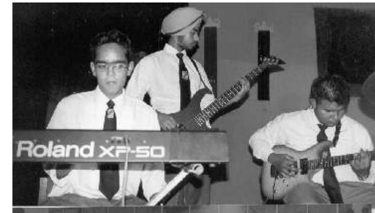
Inter House Western Music Competition- The Band

The school has been a hive of activity these last two months. There has been an unbroken stint of academics and other activities have provided much needed relief. The rains continued unabated and Simla saw many landslides and trees fell in many places. The days of sunshine were much welcome.