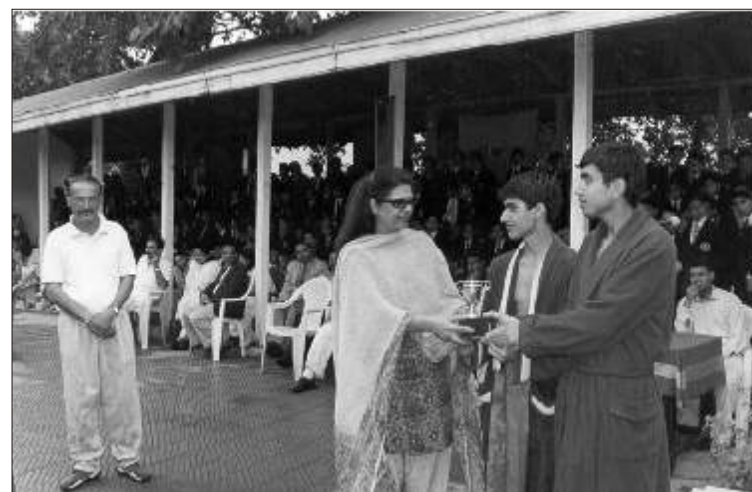
Inter House Swimming Champions 2005