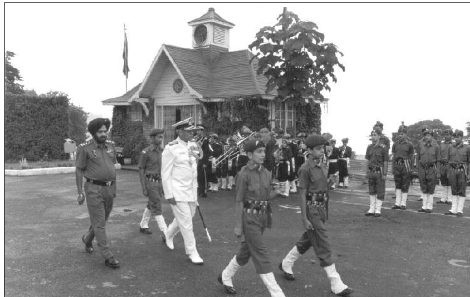
Independence Day - Guard of Honour

Good Citizenship It comprises of good conduct and behaviour in the society. It