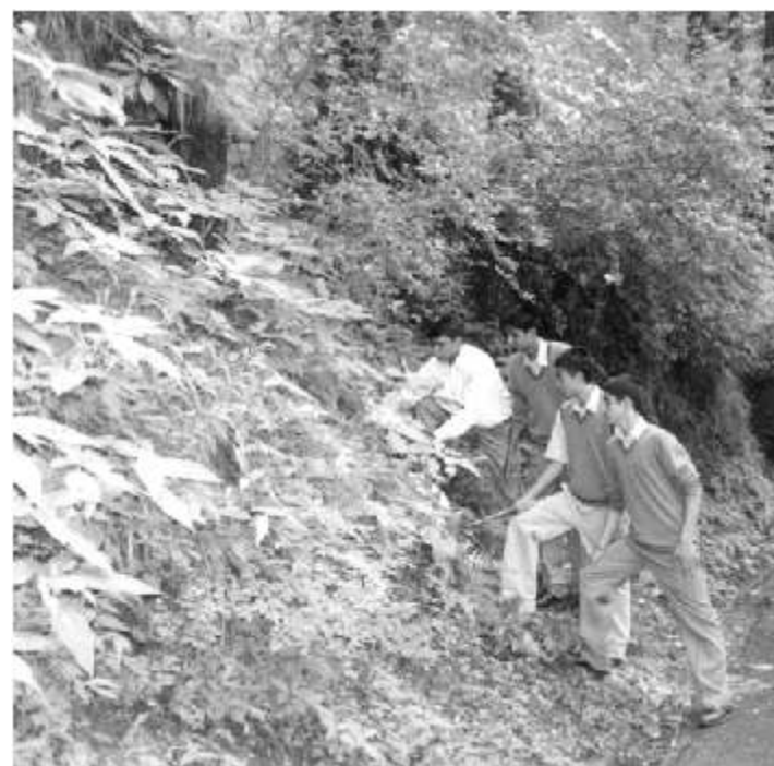
Tree Plantation at School