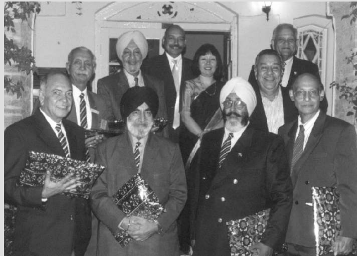
Batch of '55 Reunion