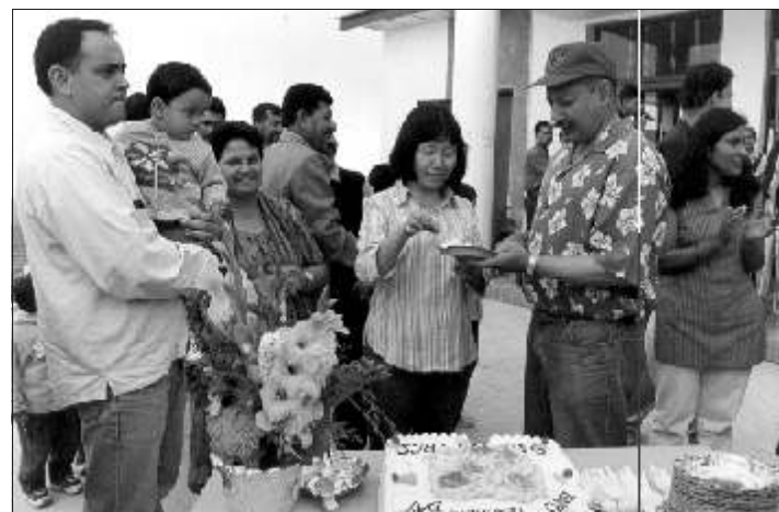
Teacher's Day at BCS